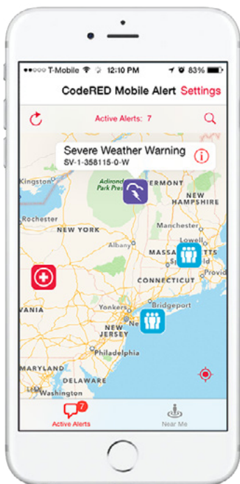
All active alerts are displayed and customized based on specific areas

The Mobile Alert app is simple to use. As a resident or visitor, you can download the free app on your smartphone. When a public safety official initiates a notification to the app using CodeRED, you'll receive a push notification directly to your phone.